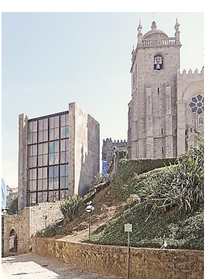
Visit to the Historic Centre of Porto