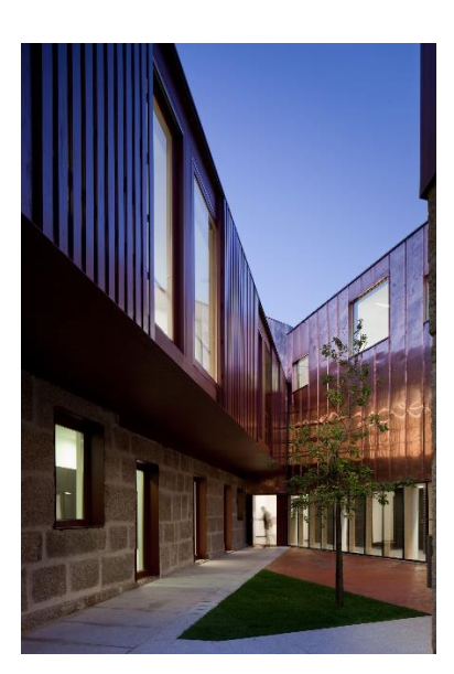
Visit to the Historic Centre of Guimarães (coord. Fernando Távora, GTL, Municipal Council since 1980s)