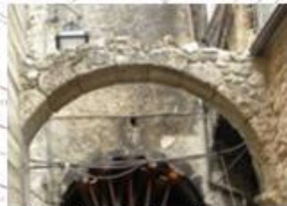
Arch for contrast