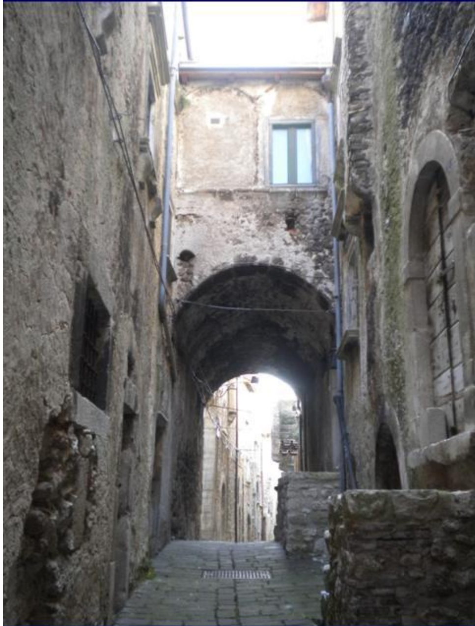
Covered Walkways and Stairs on 'profferli'