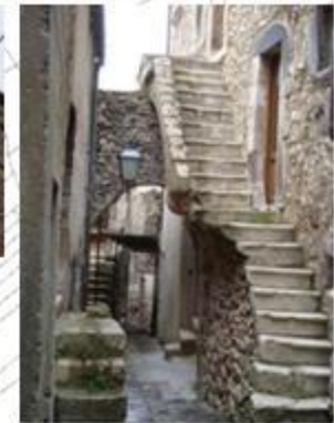
Stair on 'profferlo'