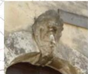
Coat of arm