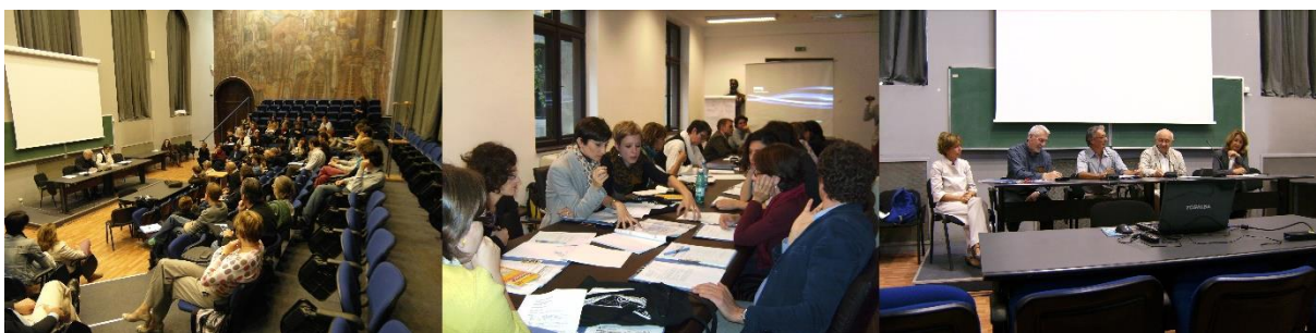
'Conservation/Regeneration: the Modernist neighbourhood', the 3rd EAAE Conservation Workshop hosted by Ion Mincu University in Bucharest, 6-9 October 2011. https://eaae2011.uauim.ro/