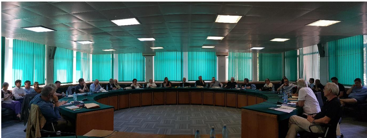
Final conclusions session of the international diploma juries at Ion Mincu University, gathering about 30 participants from several European countries + Canada, Egypt, South Korea, Turkey, USA. Bucharest, July 2019.