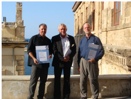
EAAE Prize Winners 2010

The EAAE invites all EAAE member schools of architecture and all individual members of EAAE to participate in the EAAE Prize 2011-2012.