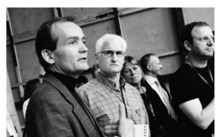
2nd VELUX Daylight Symposium, Bilbao, Spain.